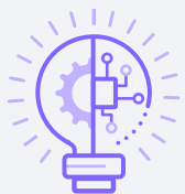
ARKK ARK Innovation ETF